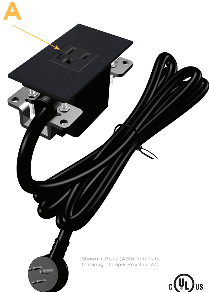
Shown in Black (ABS) Trim Plate, featuring 1 Tamper Resistant AC.