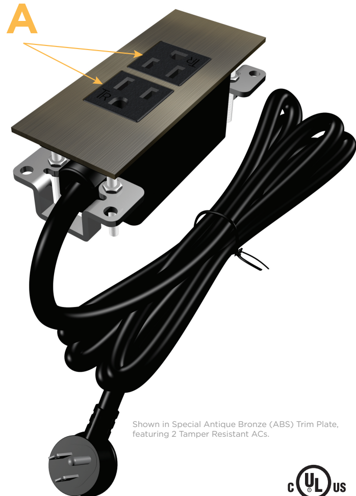
Shown in Special Antique Bronze (ABS) Trim Plate, featuring 2 Tamper Resistant ACs.