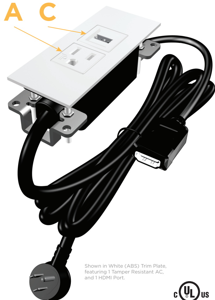
Shown in White (ABS) Trim Plate, featuring 1 Tamper Resistant AC, and 1 HDMI Port.