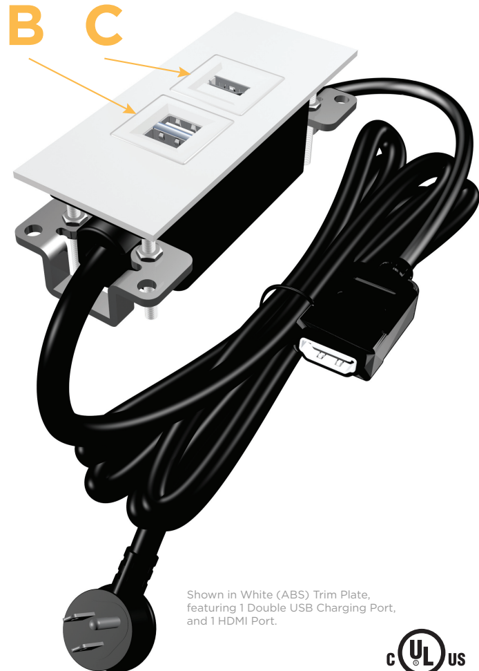
Shown in White (ABS) Trim Plate, featuring 1 Double USB Charging Port, and 1 HDMI Port.