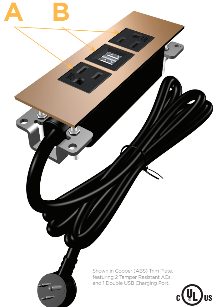
Shown in Copper (ABS) Trim Plate, featuring 2 Tamper Resistant ACs, and 1 Double USB Charging Port.