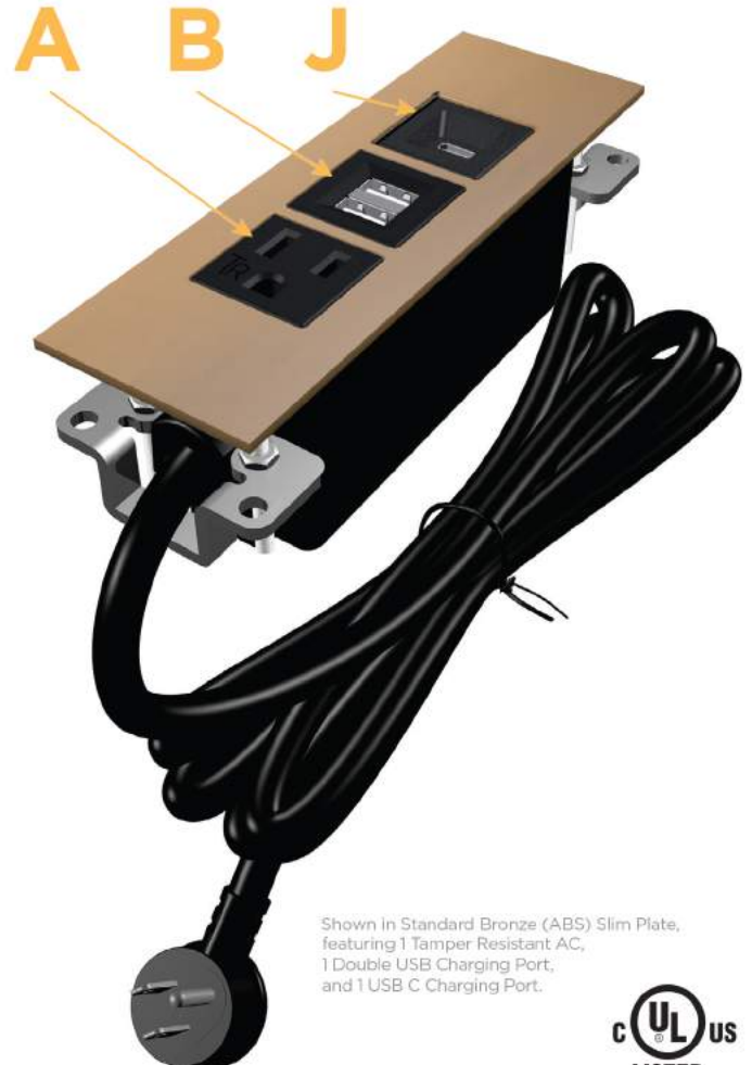
Shown in Standard Bronze (ABS) Slim Plate, featuring 1 Tamper Resistant AC, 1 Double USB Charging Port, and 1 USB C Charging Port.