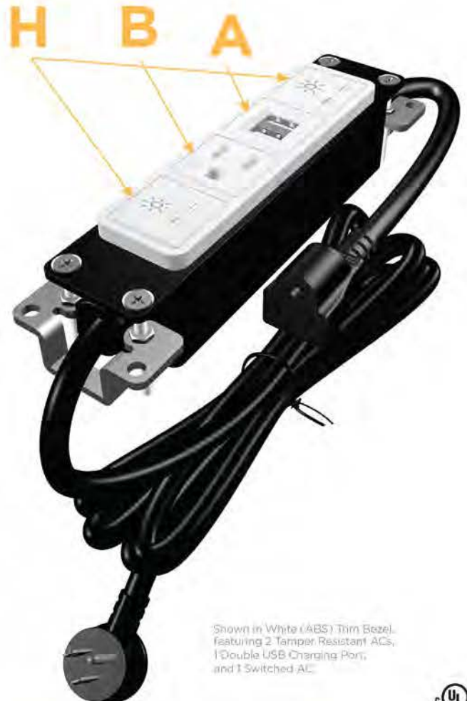
Shown in White (ABS) Trim Bezel, featuring 2 Tamper Resistant ACs, 1 Double USB Charging Port, and 1 Switched AC.