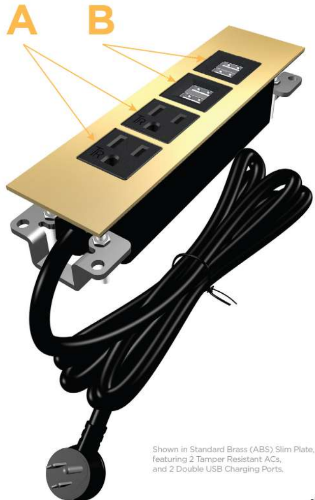
Shown in Standard Brass (ABS) Slim Plate, featuring 2 Tamper Resistant ACs, and 2 Double USB Charging Ports.