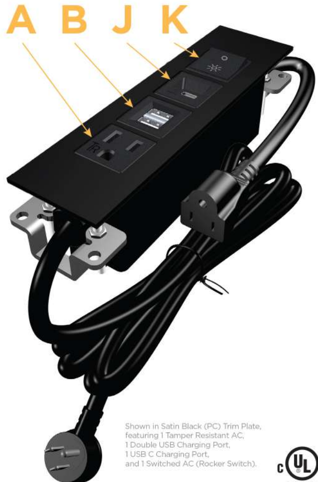
Shown in Satin Black (PC) Trim Plate, featuring 1 Tamper Resistant AC, 1 Double USB Charging Port, 1 USB C Charging Port, and 1 Switched AC (Rocker Switch).