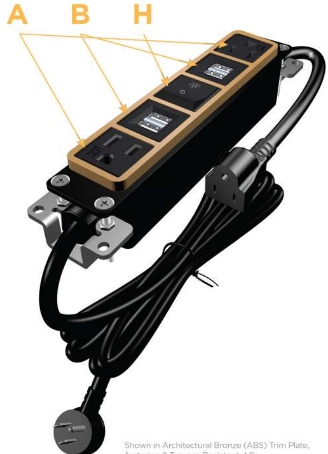
Shown in Architectural Bronze (ABS) Trim Plate, featuring 2 Tamper Resistant ACs, 2 Double USB Charging Ports, and 1 Switched AC (Rocker Switch)